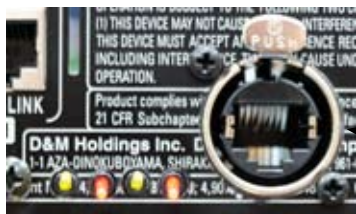
MSB Network Output

SONY MANDATES A 6 DB LEVEL CUT FOR SACD SO WE ALSO MAKE SUCH A LEVEL CUT ON CD PLAYBACK. ALL OTHER SOURCES ARE OUTPUT AT FULL LEVEL. THE MSB POWER DAC AND DAC3 NOW HAVE A 6 DB LEVEL CUT ADDED TO THE FILTER TOGGLE SO EASY A/B COMPARISONS CAN BE ACCOMMODATED. BECAUSE OF THIS LEVEL SHIFT ON CD PLAYBACK DO NOT USE THE MSB NETWORK FOR DAC FIRMWARE UPDATES. USE THE COAX OR OPTICAL SP/DIFF OUTPUT ONLY.